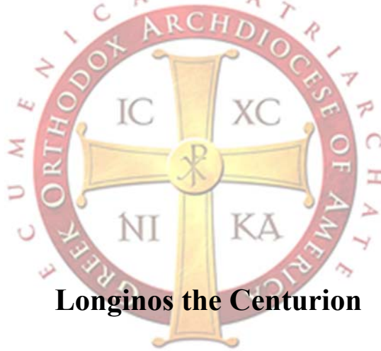
Longinos the Centurion